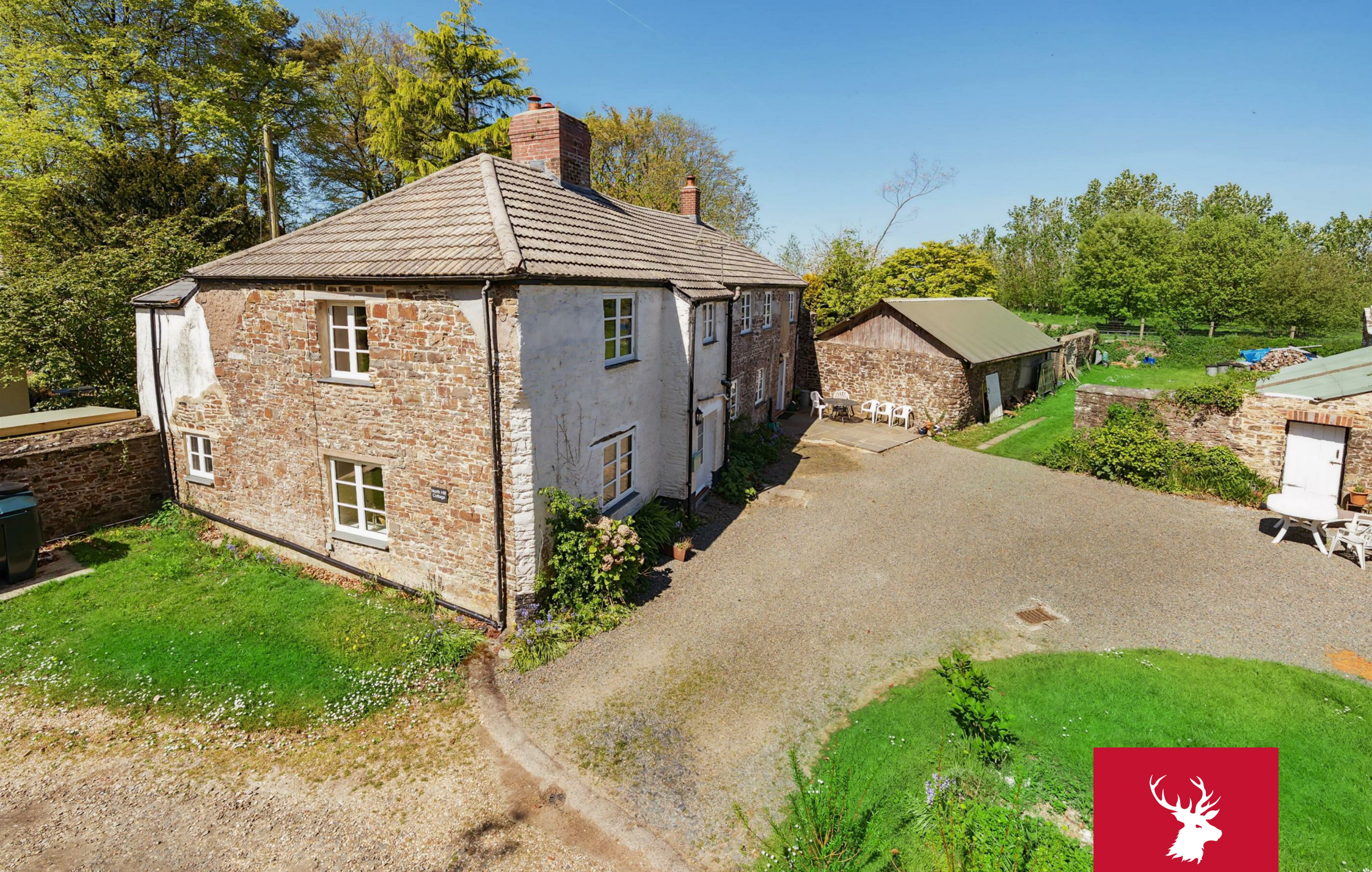
North Hill Cottage